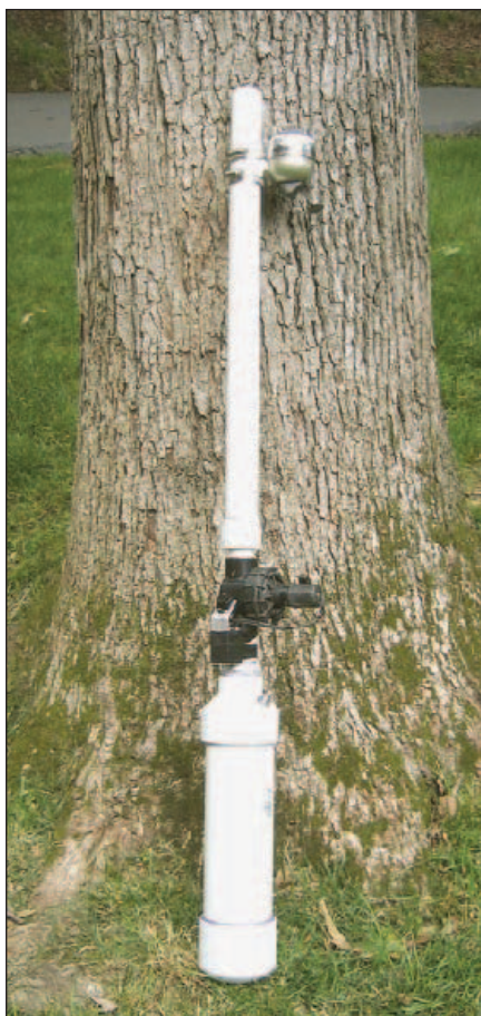
Figure 1 — The assembled antenna launcher ready to be pumped up and used.

This last factor is important since my club, the Vienna Wireless Society of Vienna Virginia, normally has our field events in public parks with many people around. This launcher attracts a friendly curiosity such as “what is that thing?” and usually generates a few “wows” and “cools” when it launches. How can you be afraid of something you pump up with a regular tire pump (see Figure 2)? Everything, including the pump and a few accessories can easily be carried in a medium size sports bag as shown