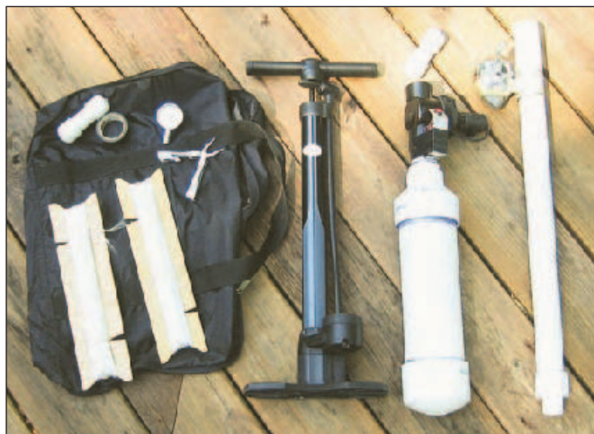
Figure 2 (left) — How can bystanders be afraid of something you pump up with a regular tire pump?

The firing trigger consists of two 9 V batteries, a safety switch and the firing button. All are wired in series and mounted to a 1 × 4 inch aluminum plate. The entire assembly (9) is then taped to the sprinkler valve. Although not shown in the figures, I would recommend that the aluminum plate be about 6 inches long and bent back above the fir-