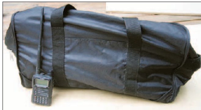
Figure 3 — All the pieces can conveniently fit in a medium size sports bag.