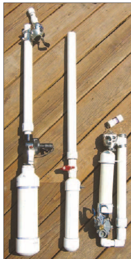
Figure 7 — Other types of valves and firing systems can be used. Right: Firing the sprinkler valve pneumatically. Center: a PVC globe valve.

Do not screw the barrel tightly into the valve; it is not necessary, nor is Teflon tape required. When you are in position and ready to fire, push the release on the fishing reel and only then drop the projectile into the barrel. Turn the safety switch to ON and fire. I find that after a shot it is easier to reel in the line or