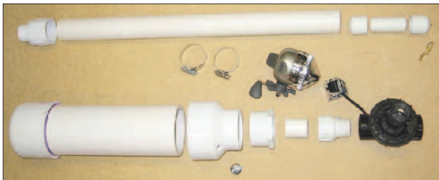
Figure 4 — The spudgun is easy to fabricate from the pieces shown.

ing button to reduce the chance of accidental firing.