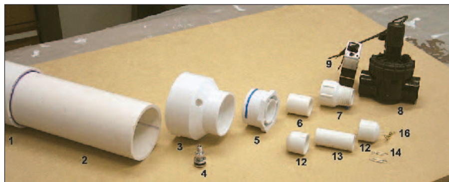
Figure 6 — More assembly details.